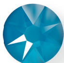
Crystal Electric Blue (001 L134S)