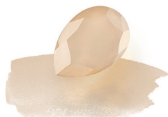
Pantone: 13-1011 TPX