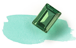
Pantone: 15-5516 TPX