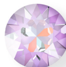
Crystal Lavender DeLite (001 L144D)