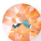
Crystal Peach DeLite (001 L140D)