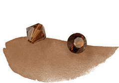
Pantone: 18-1154 TPX