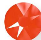
Crystal Electric Orange (001 L136S)