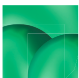
Crystal Eden Green Pearl (001 2014)