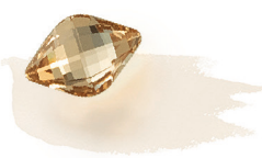
Pantone: 12-1108 TPX