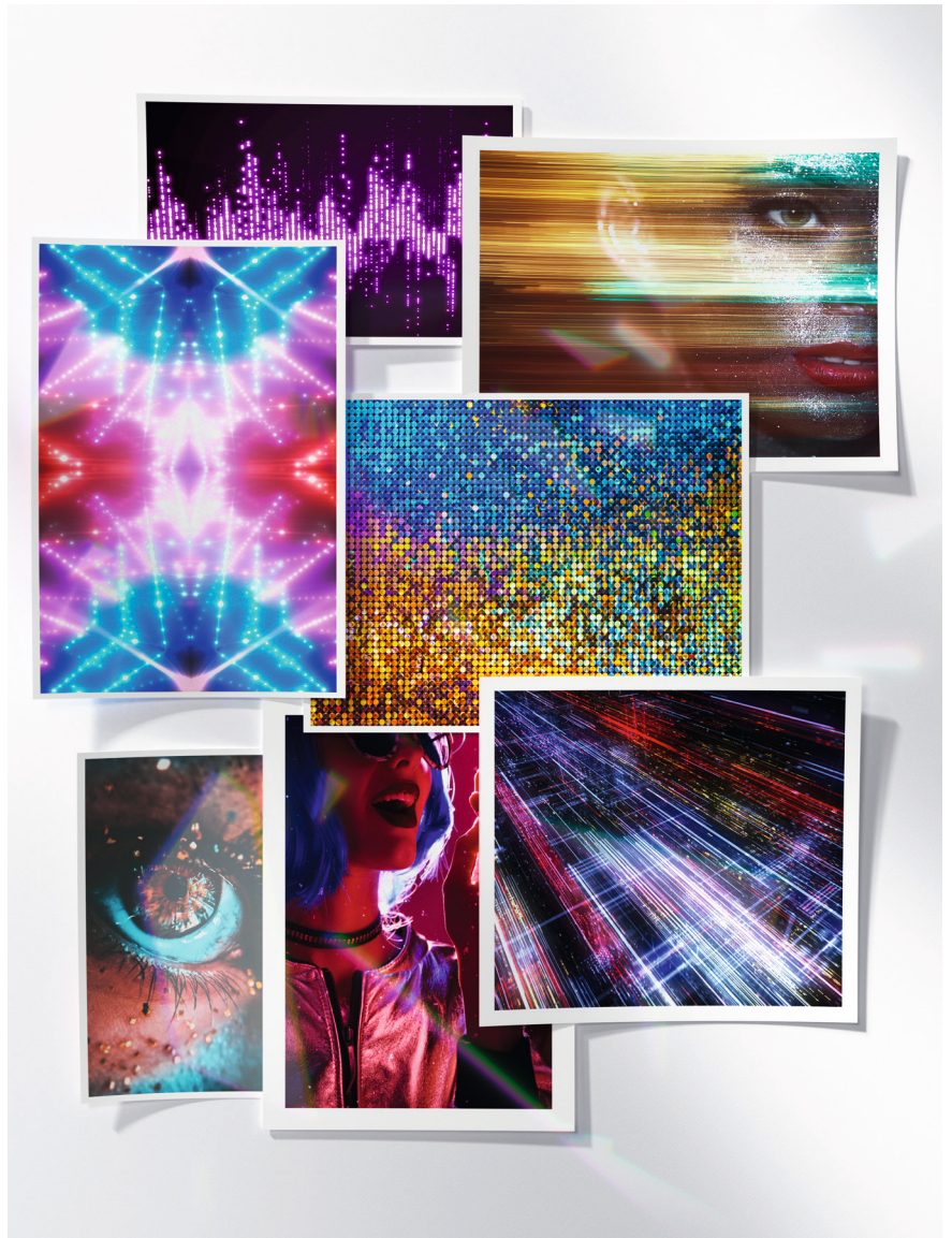
Pantone: 18-2328 TPX

The message is crystal clear: There is nowhere to hide with this joyful, expressive direction because, quite simply, who would want to!