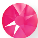
Crystal Electric Pink (001 L137S)