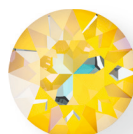
Crystal Sunshine DeLite (001 L141D)