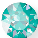
Crystal Laguna DeLite (001 L142D)