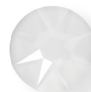
Crystal Electric White (001 L139S)