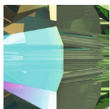
Peridot Shimmer (214 SHIM) 3