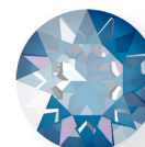
Crystal Ocean DeLite (001 L143D)