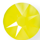
Crystal Electric Yellow (001 L138S)