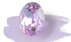
Pantone: 14-3710 TPX