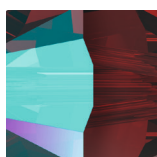
Siam Shimmer (208 SHIM) 3