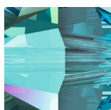
Aquamarine Shimmer (202 SHIM) 3