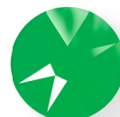
Crystal Electric Green (001 L135S)